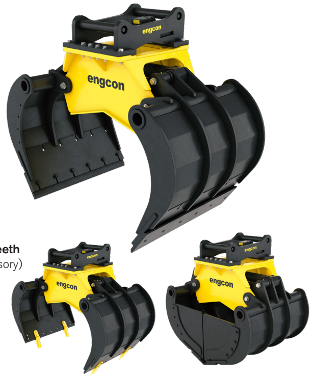
With teeth (accessory)

The EC-Oil automatic quick hitch system is a free standard on all engcon's hydraulic tools with S40–S80 attachment.